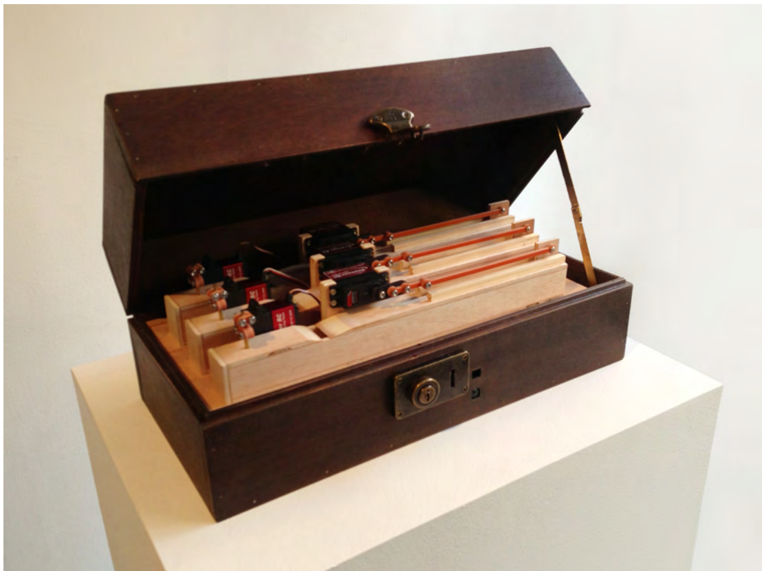
開箱作業系列-E#01 Sound.of.suitcase - E#01

持續以一種對於動力機械(kinetic sculpture)的「執迷」—即「過複雜樂器」—與「非音樂聲響」的方向，叭波箱(bubbleBox)延續了開箱作業(sound.of.suitcase)系列，透過聲音的發生，遐想尚未啟動的箱內空間。此作品亦脫離不了以樂器製造 - 「新形態樂器」與「聲響的開拓」為起點 - 而後再延伸將演奏者的角色化約至微形的數位晶片(micro-controller)。開箱作業系列，即是將古怪的樂器本身，藏匿收納於看似可隨身攜帶的旅行箱匣內，開闔之間似乎像是脫離了主人的物件從此有了靈魂一般。